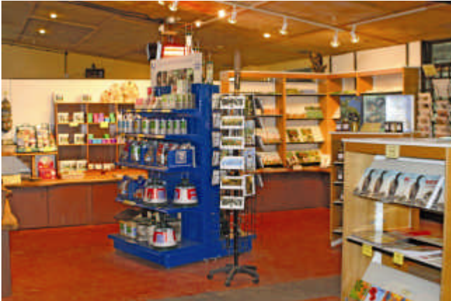
Gift Shop makeover

Spring half-term was a busy period for us, and we had many positive comments about the latest improvements we have made. Not least of these has been the installation of heating in the Visitor Centre. Although it's been a mild winter, it never seemed to be any warmer inside - until now! We're not promising tropical conditions, but it's now a good deal warmer when you come in from the cold.