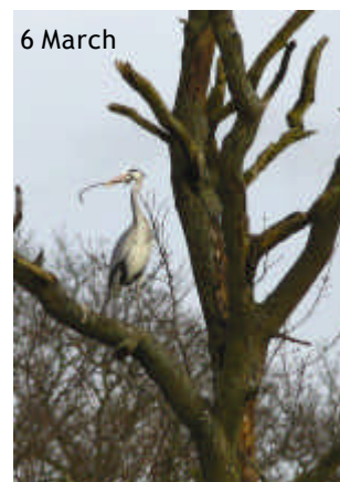
One nest blew down in a storm - leaving a puzzled owner!

There's no sign of mating activity yet, but this could change very soon if they decide the area is suitable - and the signs are very good so far!