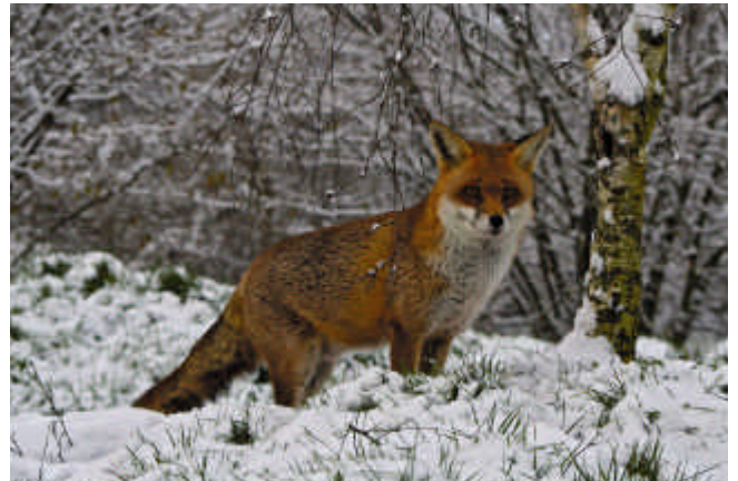
Honey exploring in the snow

Despite the wet weather, there is no doubt that Spring is well underway. It's a time of great activity for the animals, and we are hoping for new arrivals. Honey and Buster, the foxes, are both in good health, despite their considerable age (in fox terms). Last year Honey had three cubs and we are hopeful she will have more this year. The cubs are born underground and usually emerge for the first time at the very end of April or beginning of May.