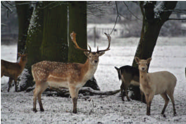
Our own fallow deer, caught in a cold snap this February.

We've recently loaned some images and objects for a fascinating temporary exhibition at the East Grinstead Museum. Called Ashdown Animals , it explores the creatures on Ashdown Forest from Norman times to the present day - a fascinating story from one of the region's most attractive historic landscapes. The Museum is open Wednesday to Saturday (10 - 4) and Sundays & Bank Holidays (2 - 5). The exhibition runs from 3 March to 3 June and entry is free.