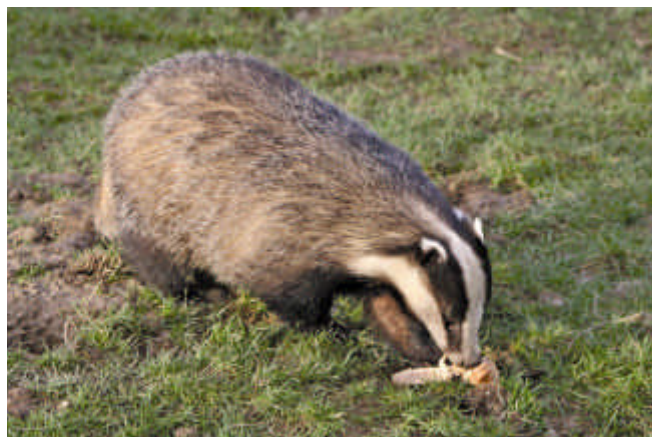
Toby out for the 4 o'clock Keeper Talk

Meanwhile, we are also improving the underground observation badger sett. When this re-opens in April, there will be lots more information and even better opportunities to see the badgers during the day. Although badgers spend much of the daytime sleeping, they do move about quite a lot to get the most comfortable position. This usually means snuggling up to a partner - or pushing them out of the way if that doesn't work!